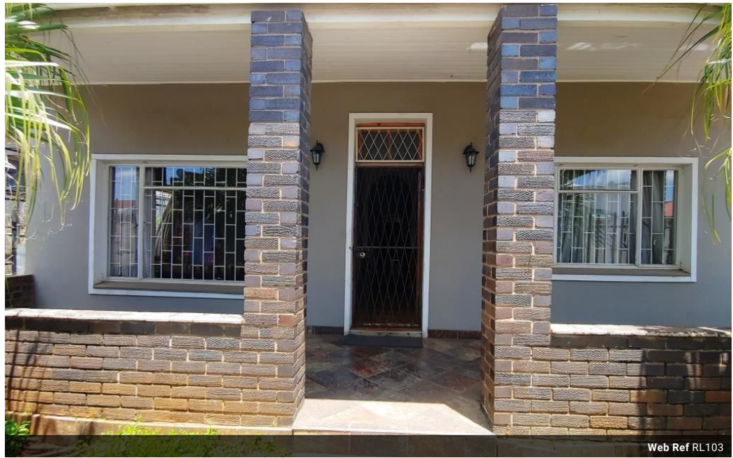
Web Ref RL103

304 Burger Street, Pietermaritzburg, 3201